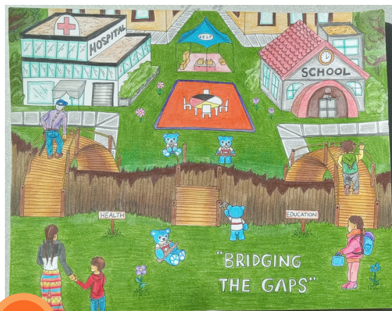
3 Artist: Jersey Quewezance