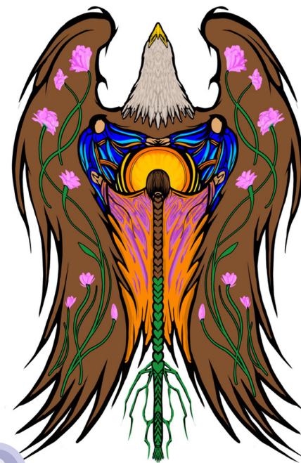
2 Artist: Brittany Cardinal